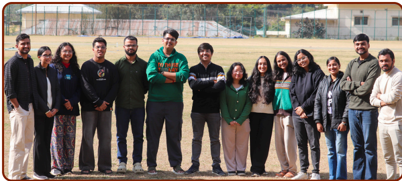
MA Development Studies, Batch 2024-26