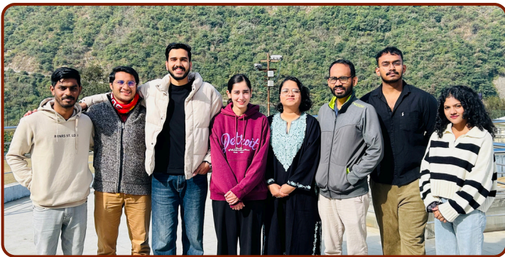
PhD Scholars, July 2024